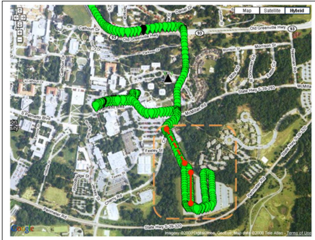
Figure 2. Coverage Data from 2/15/2009 (Basestation Identified by the Black Triangle)

uncongested scenarios the choice of MAC layer protocol (WiMAX or WiFi) has an insignificant impact on performance when devices are limited to a single omnidirectional antenna operating at 4.9 GHz. In future work, we plan to explore the impact of MIMO and adaptive antennas and the subsequent cross layer support required by the MAC layer protocol. We are also planning to expand the testbed at Clemson to possibly include WiMAX equipment operating at 2.5 GHz and at 700 MHz.