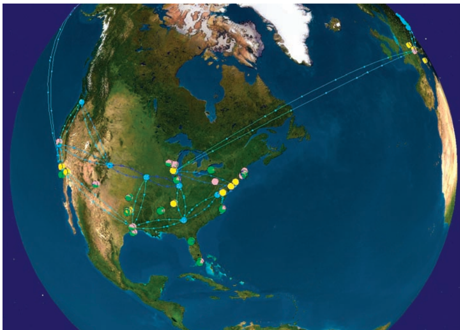
Fig. 2. The Open Science Grid links storage and computing resources at more than 30 sites across the United States to support a variety of services and applications, many concerned with large-scale data analysis. Circles show a subset of Open Science Grid sites; lines indicate communications, some with international partners.

flow orchestration services, and so forth—and provide access to the hardware resources required to operate both those functions and the application-specific services that constitute the communities “content.” In this case, the supporting infrastructure must provide a much richer set of capabilities than does SourceForge, encompassing, for example, access control, accounting, provisioning, and related management issues. As noted above, Grid architectures and software (15) address many of these concerns, allowing users to focus on providing “content,” which in this case comprises not just Web pages but also services, data, and programs.